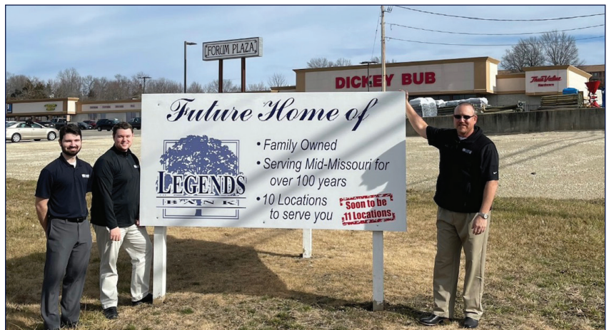
Above: Main Bank expansion, exterior and interior. Above Right: Union Bank remodel - existing office conversion to New Accounts Office, and new offices to be completed this fall. Right: Future home of our second location in Rolla.