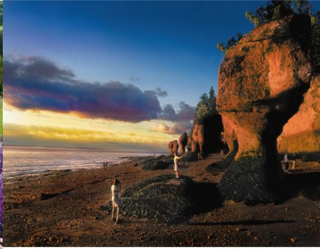
Hopewell Rocks at Low Tide