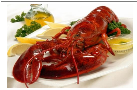
Lobster Luncheon Cruise