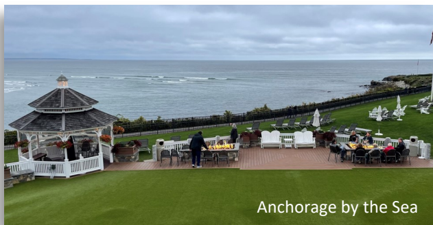
Anchorage by the Sea

After breakfast, we make our way to the Boston airport for our flight home. We'll be taking with us warm, fall-colored memories of beautiful New England!