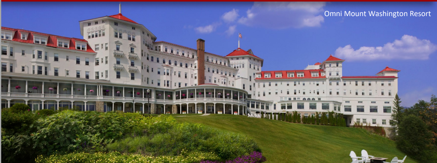
Omni Mount Washington Resort